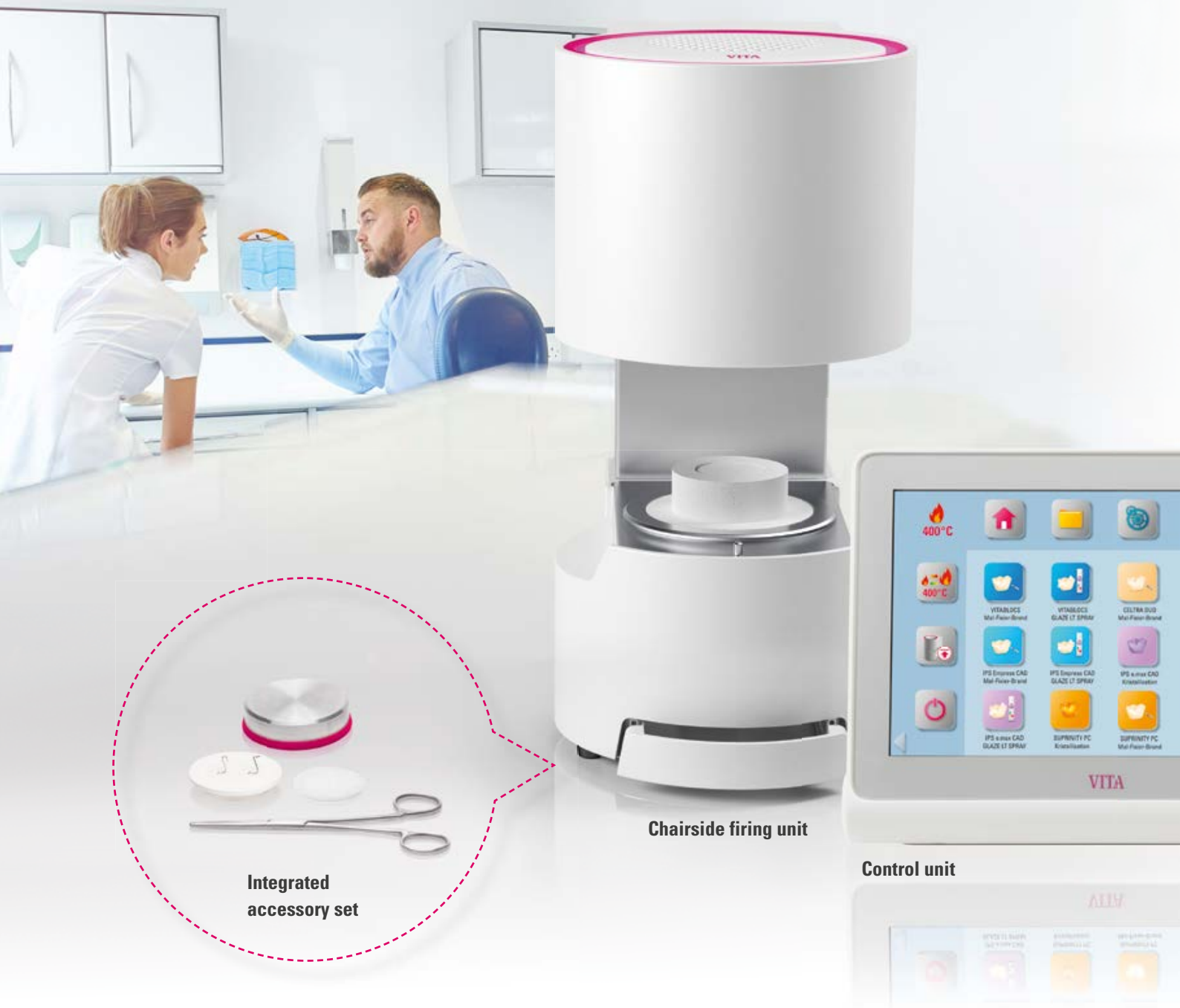
Integrated accessory set